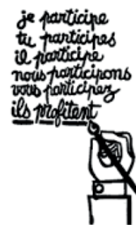
FIGURE 1 French Student Poster. In English, I participate; you participate; he participates; we participate; you participate . . . They profit.

There is a critical difference between going through the empty ritual of participation and having the real power necessary to affect the outcome of a process. This difference is brilliantly displayed in a poster painted by French students to explain the student-worker rebellion in 1968. The poster highlights the fundamental point that participation without redistribution of power is an empty and frustrating process for the powerless. It allows the power holders to claim that all sides were considered, but makes it possible for only some of those sides to benefit. It maintains the status quo 1 .